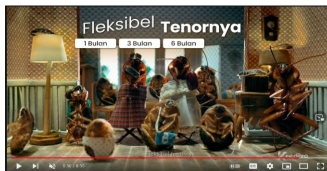
Figure 4: Part 4 of Kredivo commercial

At the end of Kredivo commercial entitled “Hidup #sefleksibleitu” appeared a group of cockroaches that dressed as humans in a living room. The narration of that scene is "fleksibel tenornya" which is translated as a flexible tenor. This scene bothers the researchers, therefore this part will discuss the relation of cockroaches to Kredivo's market target. Before discussing the relation, the denotative meaning of the environment, the cockroach and its costume, and