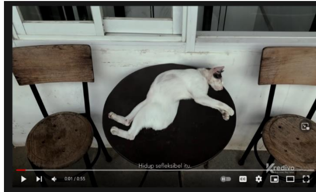
Figure 1: Scene 1 of the Kredivo commercial

Two pictures above are snipped from the beginning of the Kredivo “ Hidup #Seleksibelitu ” commercial. At the opening of the commercial, two different cats are shown in different places. The first cat is presented sleeping on a nice black sofa while the second cat is presented sleeping on a simple table located outside the room. It looks like the two cats sleep comfortably even though they are in different places. The opening of the commercial features a cat accompanied by the narration "Life as flexible as it can be". The narration shows that two sleeping cats are living a flexible life which is presented by their flexibility to be able to sleep comfortably in two different places, the sofa and table.