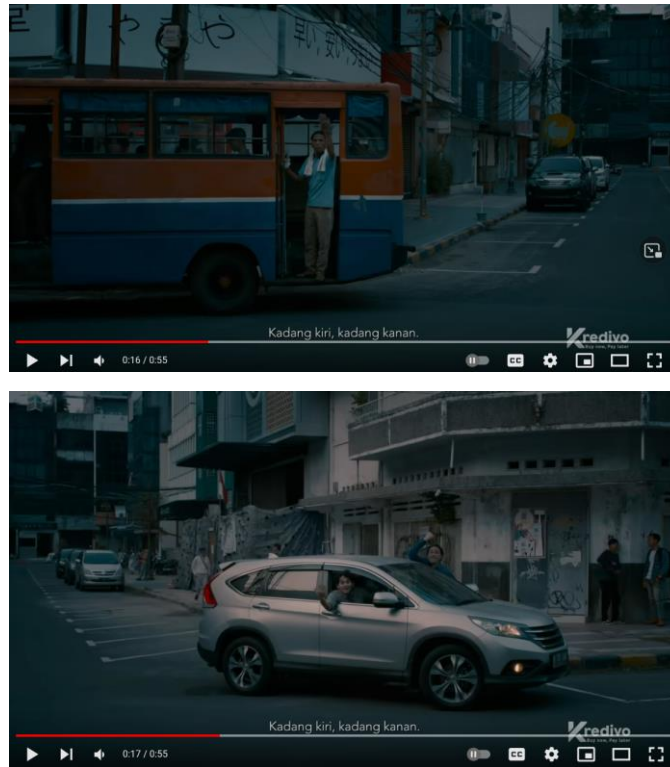
Figure 2: Scene 2 of the Kredivo commercial